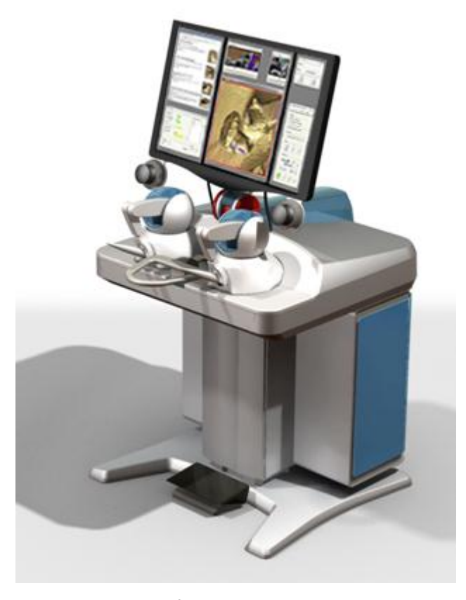
Prototype of VOXEL-MAN Tempo

VOXEL-MAN Tempo is a compact unit that comes as a table-top or stand-alone system.